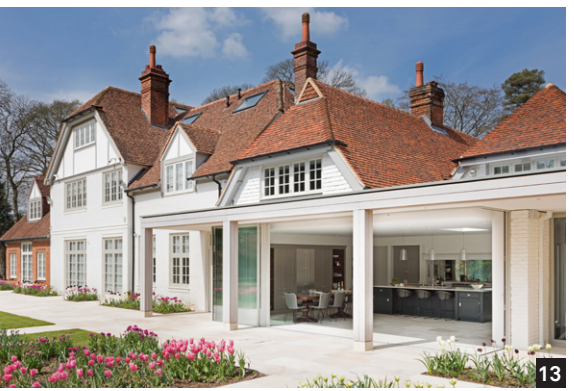
Reeds , Liss

Our large contemporary extension in the South Downs National Park is now complete. The original 16th century farmhouse had been substantially extended over the centuries. Our design, with its colonnaded and framed structure reinterprets the construction of the original house and opens up the property to its extensive landscaped grounds. The clients